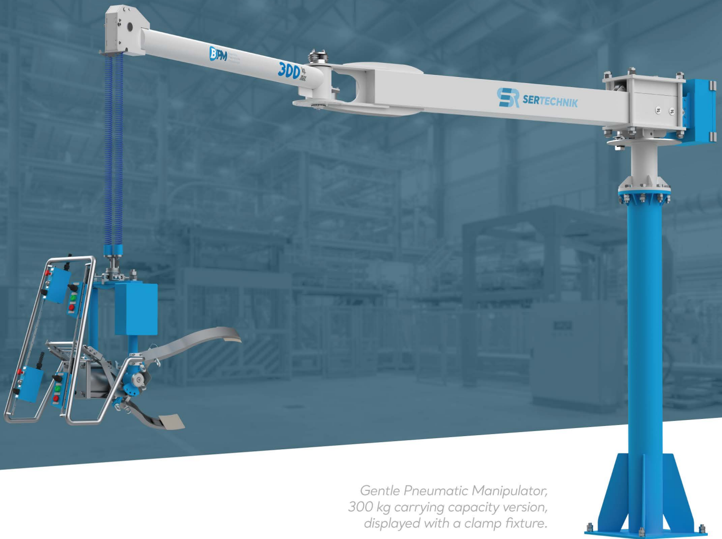
Gentle Pneumatic Manipulator, 300 kg carrying capacity version, displayed with a clamp fixture.

Gentle Pneumatic Manipulators are designed to move operator-centered loads within the work area with minimum effort. It balances the weight of the load, allowing the operator to carry the load quickly and safely.